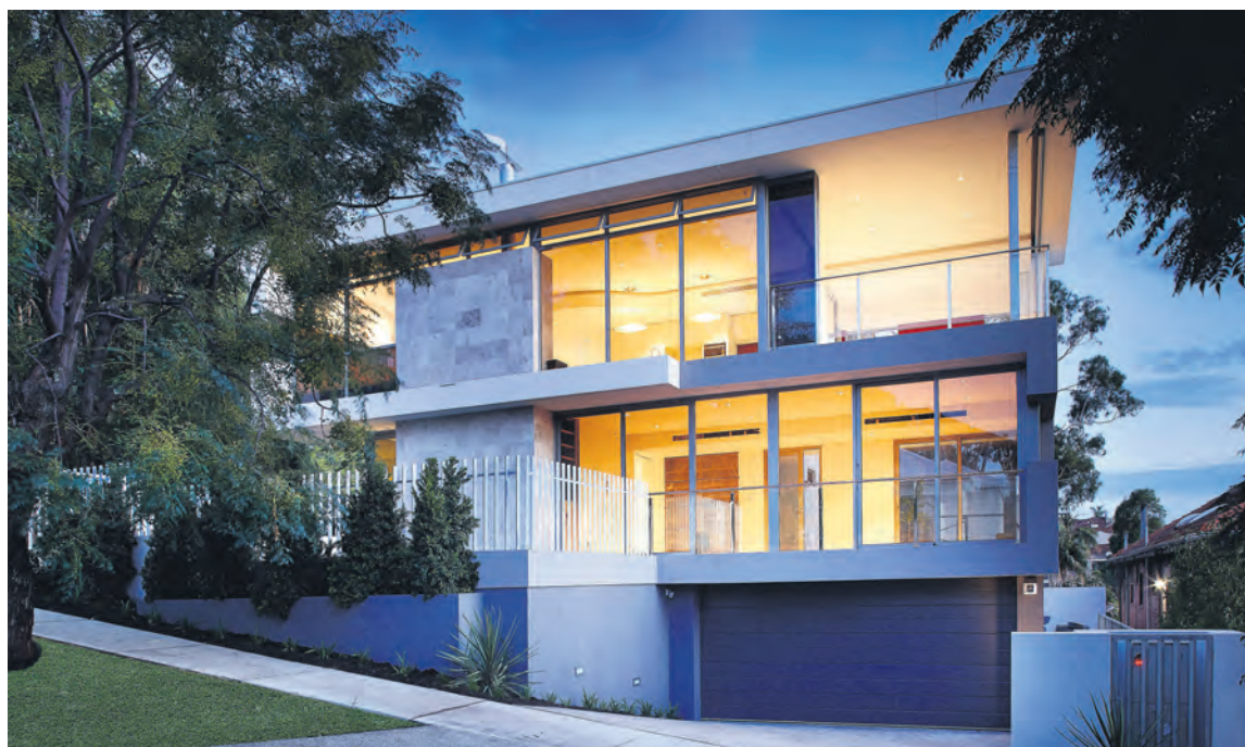
The home is environmentally friendly with double glazing for thermal and acoustic insulation.

The owners were heavily involved in the planning,